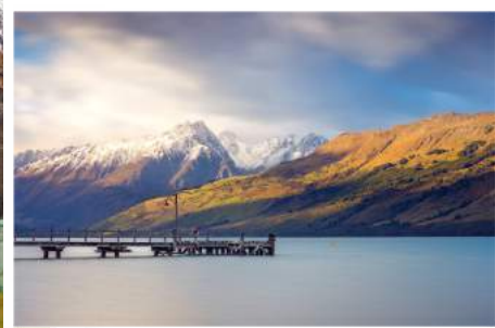
Red Shed + Jetty in Glenorchy