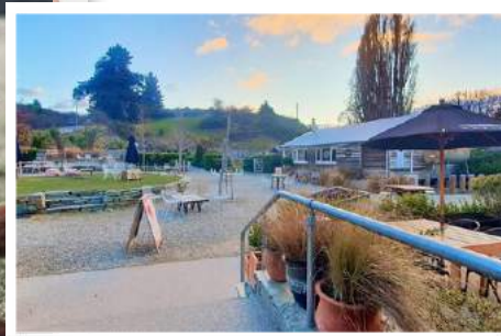
Real Country NZ + BuzzStop