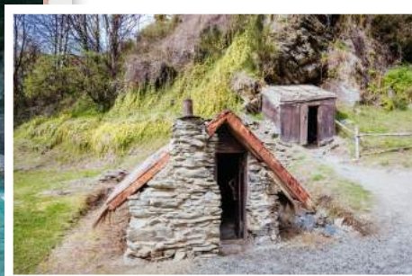
Edith Cavell Bridge + Chinese Village